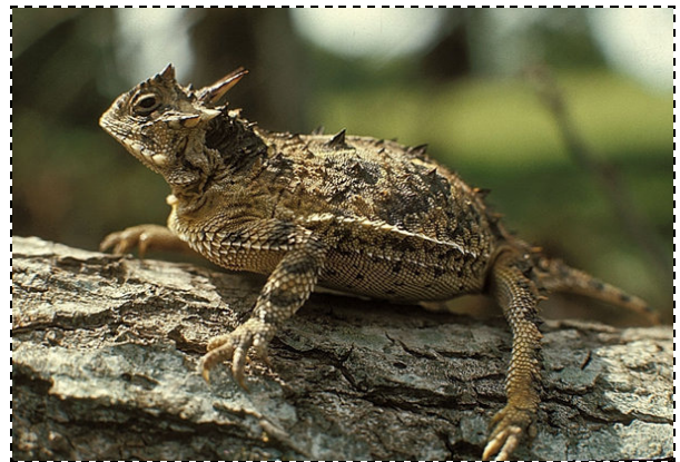
Texas Horned Lizard ( Phrynosoma cornutum )

What is your favorite Texas plant and/or animal? Right now I'm super focused on the horned lizard. We have ideal habitat for these little guys, and we are working to keep improving our grasslands to make them even more hospitable to harvester ants and horned lizards.