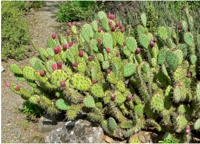
Prickly Pear Cactus ( Opuntia littoralis)

framework, as anyone in TXSER knows, it's often impossible to guarantee outcomes when the weather patterns are so uncertain. In 2006, I became active and eventually served as president for the Austin Parks Foundation (APF). APF has been a leader in helping develop public/private partnerships to improve the ecological management of Austin's tremendous asset of parks and greenbelts. As the population of Austin grows, the former policy of benign neglect was clearly taking its toll. In 2009, my family purchased property in southwest Llano County, and we have worked steadily to gain intimate knowledge of our land, and to attempt to improve conditions there. We have