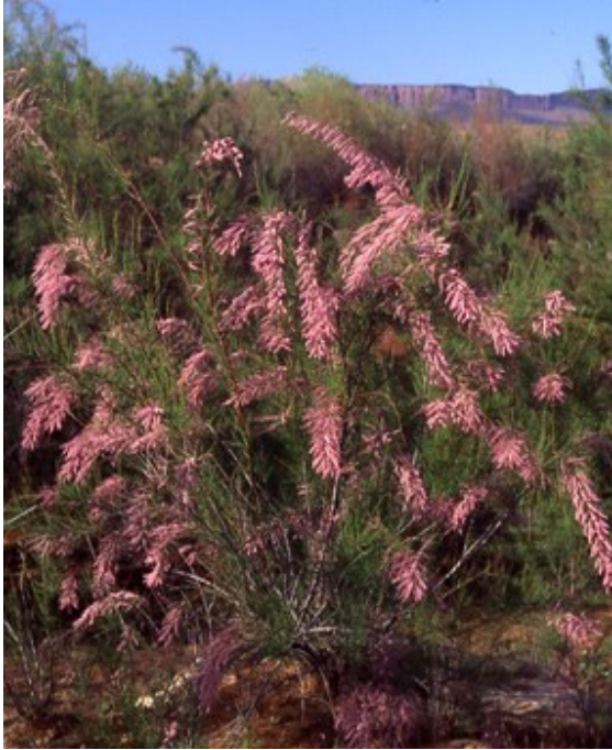
Tamarisk ( Tamarix chinensis )