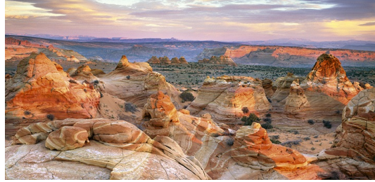
Photo: Coyote Buttes.