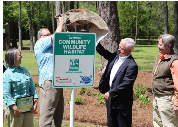
National Wildlife Federation

The City and County of Denver intends to become a certified Community Wildlife Habitat by the end of 2019 through the National Wildlife Federation (NWF). This process will result in the creation of habitat gardens, spaces, parks, etc. throughout the city while increasing awareness of their benefits for people, wildlife and water.