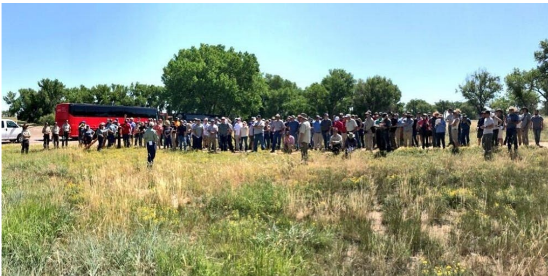
Weed Network Field Tour

Meet at 6075 East I25 Frontage Road, Erie, CO 80516