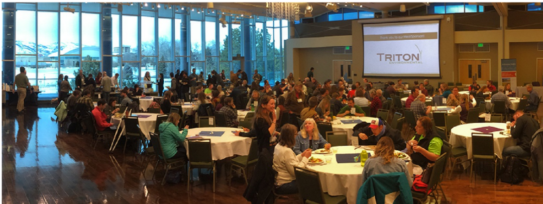
Lunch and breaks provided many networking and outreach opportunities for conference participants, vendors, and sponsors.