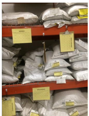
From left to right: Native Colorado Plateau plant species growing at the Rim to Rim Restoration plant nursery near Moab, Utah; bags of seed stored at the Colorado Parks and Wildlife Seed Warehouse in Delta, CO.