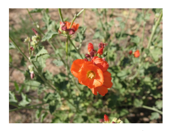
CPNPP priority species Sphaeralcea parvifolia c/o UT931