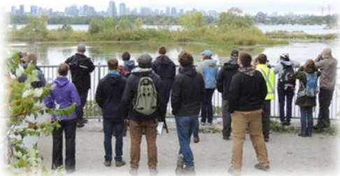
Restored Wetland with City Skyline