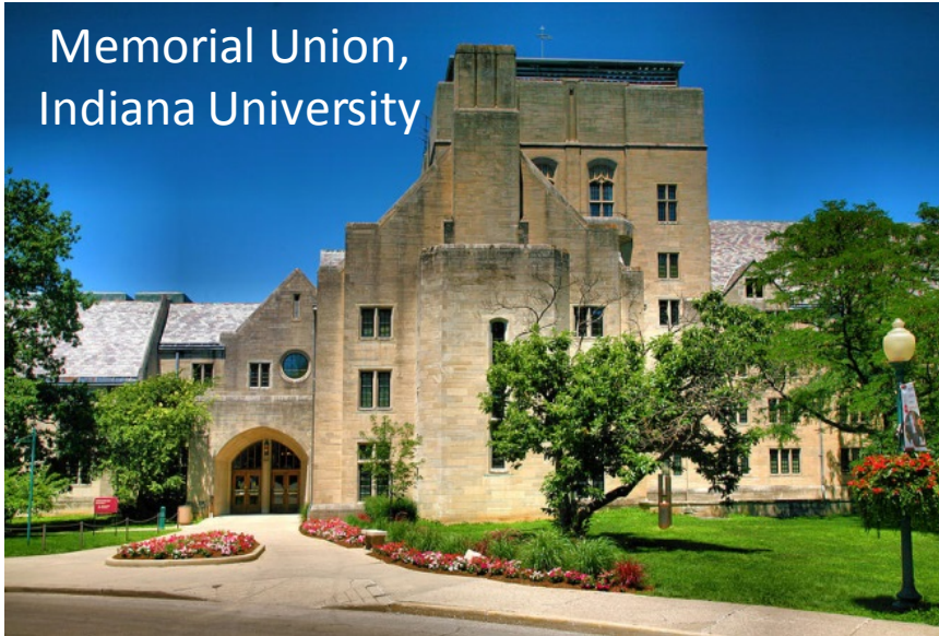
Memorial Union, Indiana University